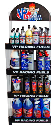
VP Power Center Rack