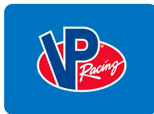
VP Racing Fuels Counter Mat