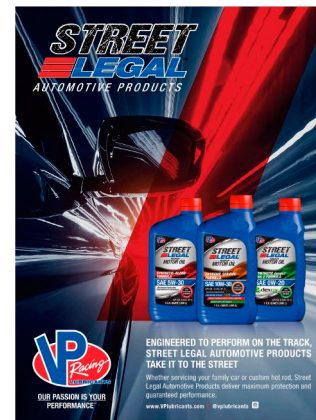
VP Racing Lubricants Poster