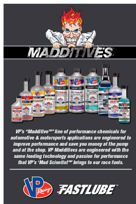
VP Racing Madditives Poster

Although not required, it's recommended a menu reflecting prices for services be displayed in the reception area. If such a menu is displayed, it must include a prominent VP Racing Fuels POWERWASH logo. Consult with your VP Racing Fuels representative regarding appropriate size and materials for the price menu sign. NOTE: Illustration for Design Intent Only .